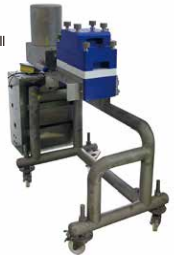
Easy to move with casters.

It is also possible to install a belt conveyor for continuous production. (The belt conveyor is optional.)