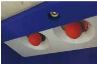
Discharge port (double type)