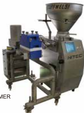
Examples of Connections: STUFFWEL 51 + BALL FORMER