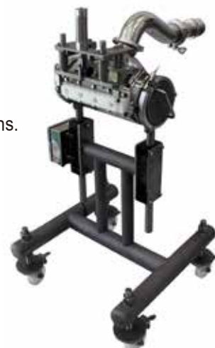
Easy to move with casters.