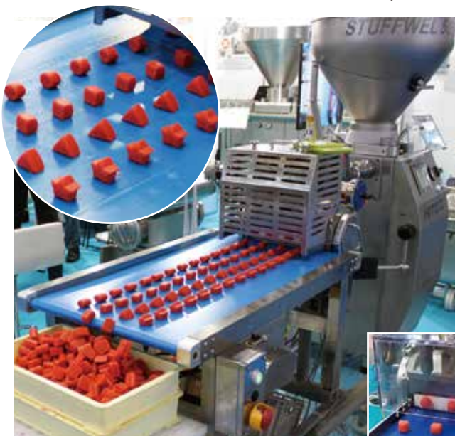
Discharge outlets can be designed in a variety of shapes, such as round, square, triangular, or star-shaped.